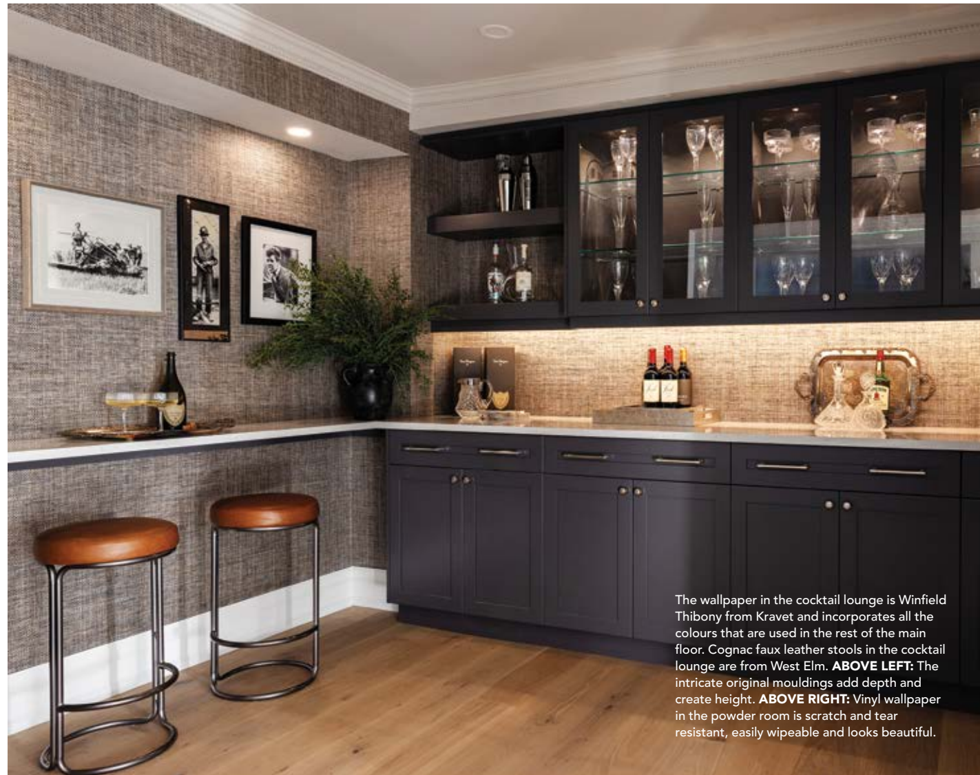
The wallpaper in the cocktail lounge is Winfield Thibony from Kravet and incorporates all the colours that are used in the rest of the main floor. Cognac faux leather stools in the cocktail lounge are from West Elm. ABOVE LEFT: The intricate original mouldings add depth and create height. ABOVE RIGHT: Vinyl wallpaper in the powder room is scratch and tear resistant, easily wipeable and looks beautiful.